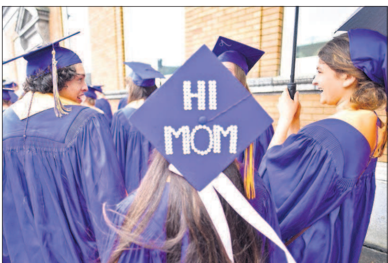
ABOVE: The Astoria High School Class of 2017 held their annual parade through downtown Thursday.