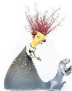
"White Rabbit Steals the Jeweled Crown," a ceramic and mixed-media sculpture by Jacqueline Hurlbert at RiverSea Gallery