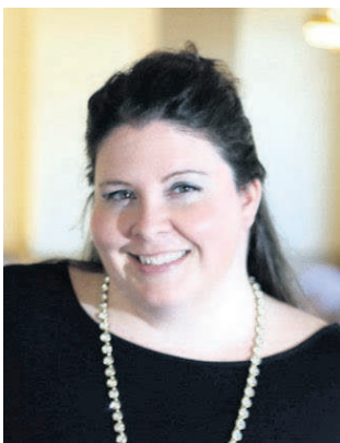
Angela Meade will return to sing Verdi at the 2016 Astoria Music Festival.

For a full list of events, visit astoriamusicfestival.org .