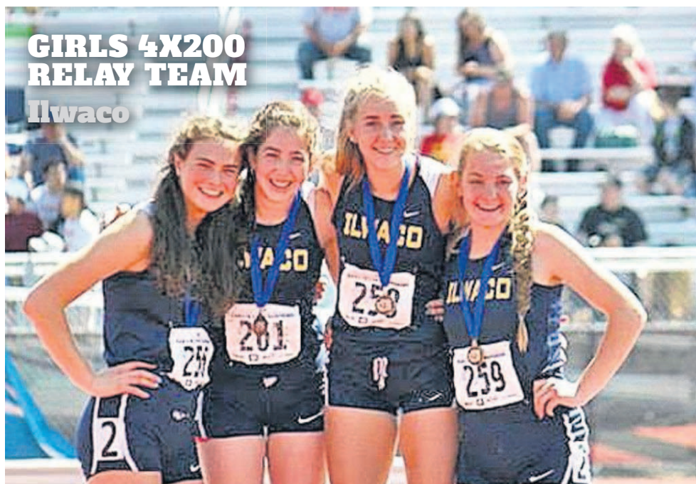
GIRLS 4X200 RELAY TEAM Ilwaco