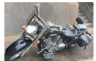
05' Honda VTX1300 $3950-Incl extra luggage & helmet. 22k miles, top shape. 503-325-0960

Occasionally other companies make telemarketing calls of classified ads. These companies are not affiliated with The Daily Astorian and customers are under no obligation to participate. If you would like to contact the attorney general or be put on the do not call list, here are the links to both of them Complaint form link: http://www.doj.state.or.us/finfraud/