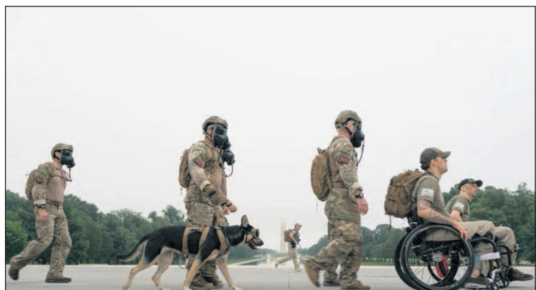
Members of the veterans support group "Ruck to Remember" walk along the National Mall in Washington Monday as they continue their Memorial Day march to Arlington National Cemetery.

Meanwhile, genuine respect for America's war dead is best translated into remembering living veterans and tending to their needs. Memorial Day is only the start, not the finish, of recognizing the debt we owe to veterans. Truly honoring them means embodying their values and honor in our own lives every day of the year.