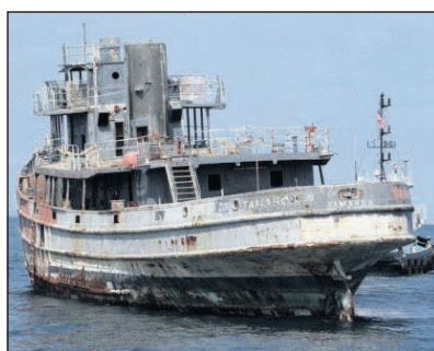
The vessel's most notable mission came in October 1991, when three strong storm systems came together

The Tamaroa was first commissioned by the U.S. Navy in 1934 under the name Zuni and saw action during World War II when it helped tow damaged vessels across the war-torn Pacific Ocean. It was transferred to the Coast Guard and renamed in 1946, then continued to serve until it eventually was decommissioned in 1994.