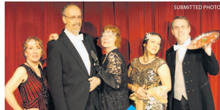
"You Never Know" 7 p.m., NCRD Theater, 36155 9th St., Nehalem, 503-368-7008, $15. Cole Porter's "You Never Know" is a romantic musical comedy set in Paris in 1929 filled with delightful, witty Cole Porter songs.

10 a.m., Harbor front at Howerton Way, Port of Ilwaco, Wash. This