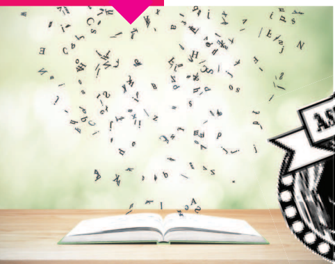
Coast Weekend editor suggested events

7 p.m., Hoffman Center, 594 Laneda Ave., Manzanita, 503-368-3846. The book release of "May the Forest Be With You" is a project of Rockaway Beach Citizens for Watershed Protection compiled by 24 artists, writers, scientists and musicians.