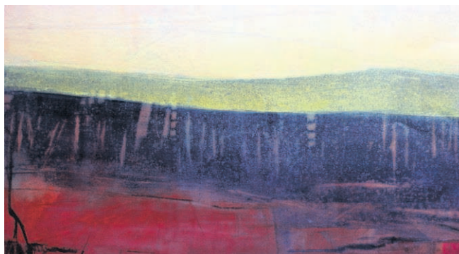
Gin Laughery's "Daily Ritual," on display at Imogen Gallery.