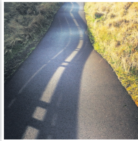
A shadow cast by the Long Beach boardwalk winds along the Discovery Trail.