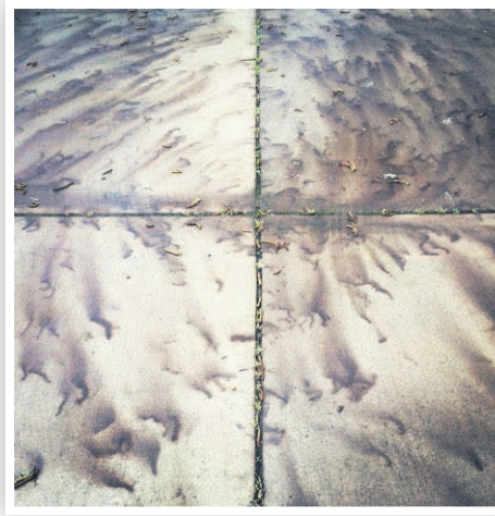
Tree litter, wind and rain combine to interesting effect after a spring storm.