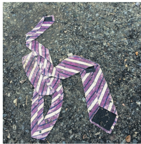
A crumpled tie is all that remains in a tavern parking lot on a Sunday morning.