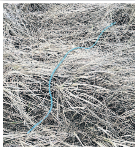
A short length of teal-colored rope cuts across a sun-bleached patch of dune grass.