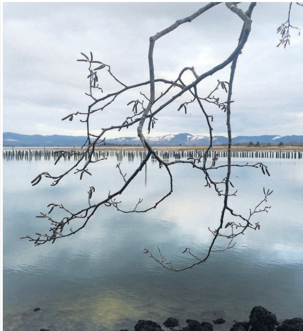
A near-barren branch extends over the late-wintery chill of Baker Bay.