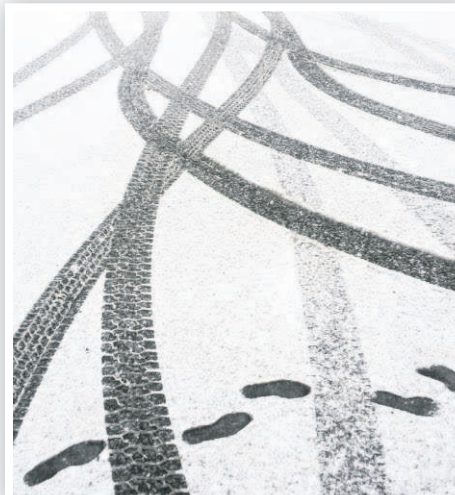
The tracks, and the snow, didn't last long after an early February flurry.