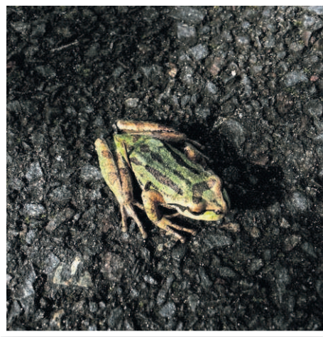
A tiny green and brown tree frog rests along the Seaview beach approach road.

L ONG BEACH — They say it's springtime, but my soaked exercise clothes and dog beg to differ. As the seasons ever-so-slowly have changed from winter to spring here on the Peninsula, I've found that my daily walks with the dog have gradually gotten longer again. For those of you new to this series, these photos were all made during my daily 3- to 5-mile morning walk with my dog through Long Beach and Seaview. This is the third installment of "greatest hits" of the things I see and find on the walks, which we named, "Peninsula Postcards." In fact, I've been making so many photos on these trips that I dedicated my Instagram feed to it, which you can find at www.instagram.com/seenonwalks .