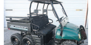
2002 Polaris Ranger 700 6x6 utility vehicle, 982 hours, automatic transmission, starts and runs great, $ 2,000 Call: (541)375-0364

BROWNSMEAD TURBO GRO Partially dehydrated dairy compost. For the garden. $25/yard. Call by appointment (503)458-6821. Make your garden great again!