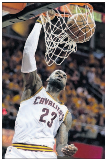
Cleveland Cavaliers' LeBron James dunks against the Toronto Raptors in the second half in Game 1 of a second-round NBA basketball playoff series, Monday in Cleveland. The Cavaliers won 116-105.