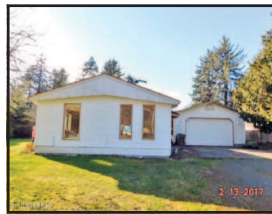
55 Tye Hammond $150,000