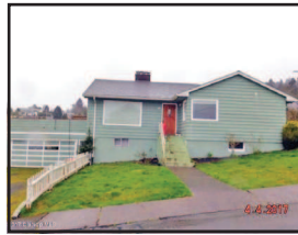
794 33rd Ave. Astoria $224,500