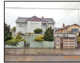
1435 5th St. Astoria $200,000