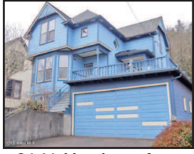
3141 Harrison Ave. Astoria $289,500