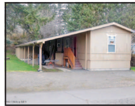
1865 1st Ave. Hammond $135,000