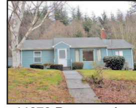
44279 Peterson Ln. Astoria $259,900