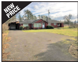
NEW PRICE 89657 Hwy 101 Warrenton $155,000