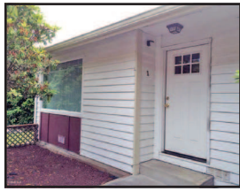
920-980 Klaskanie Astoria $1,180,000