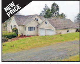
NEW PRICE 35207 Fick Ln. Astoria $279,900