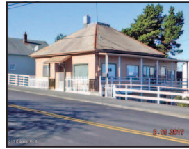
474 Bond Ave Astoria $219,900