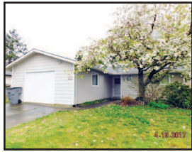
2457 Pine St. Seaside $224,900