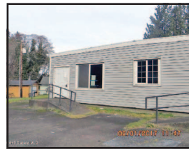
91159 Hungry Hollow Lp. Astoria $99,000