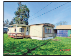
92402 E Rd. Astoria $85,000

We hold the key to making your dreams come true!