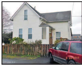
881 Pacific Dr. Hammond $199,000