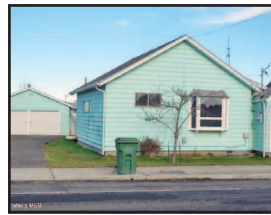
625 E. Harbor Warrenton $165,000