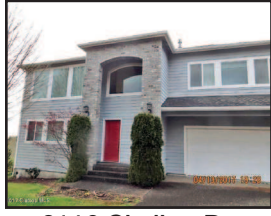
2110 Skyline Dr. Seaside $344,900