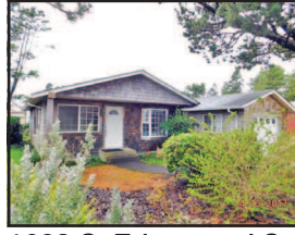
1638 S. Edgewood St. Seaside $269,000