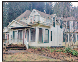
19536 Beaver Falls Rd. Clatskanie $187,200