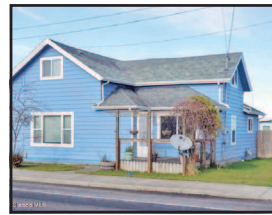
615 E. Harbor Warrenton $175,000