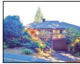
2816 Irving Ave Astoria $389,000