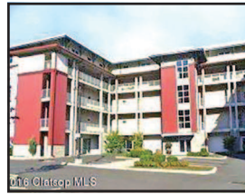
3930 Abbey Ln #209 Astoria $209,900