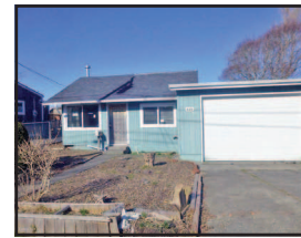
840 11th Ave. Seaside $164,900