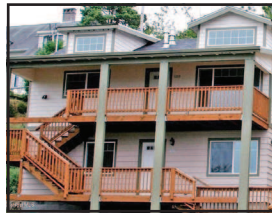
1089-1099 Irving Astoria $729,500