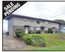
SALE PENDING 952, 962, 964 & 974 Harrison Astoria $450,000