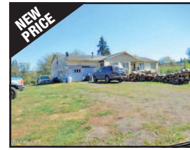
NEW PRICE 89635-89633 Green Mountain Rd Astoria $349,000