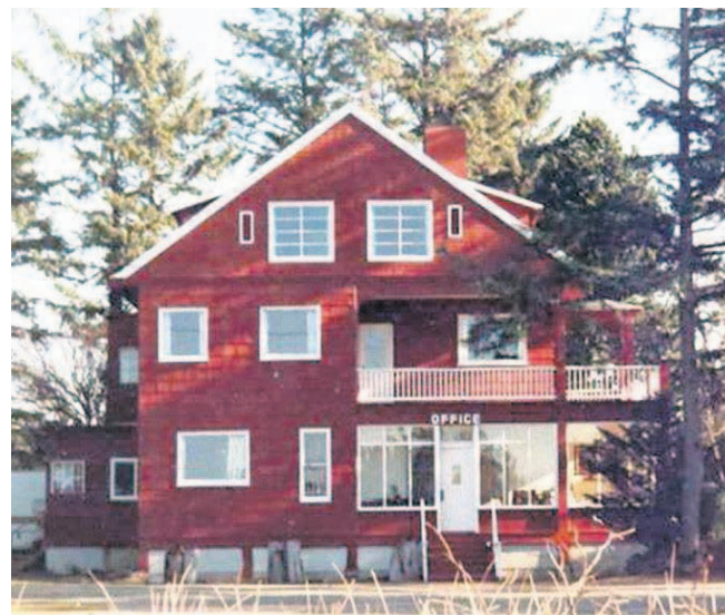
The Sou'wester Lodge