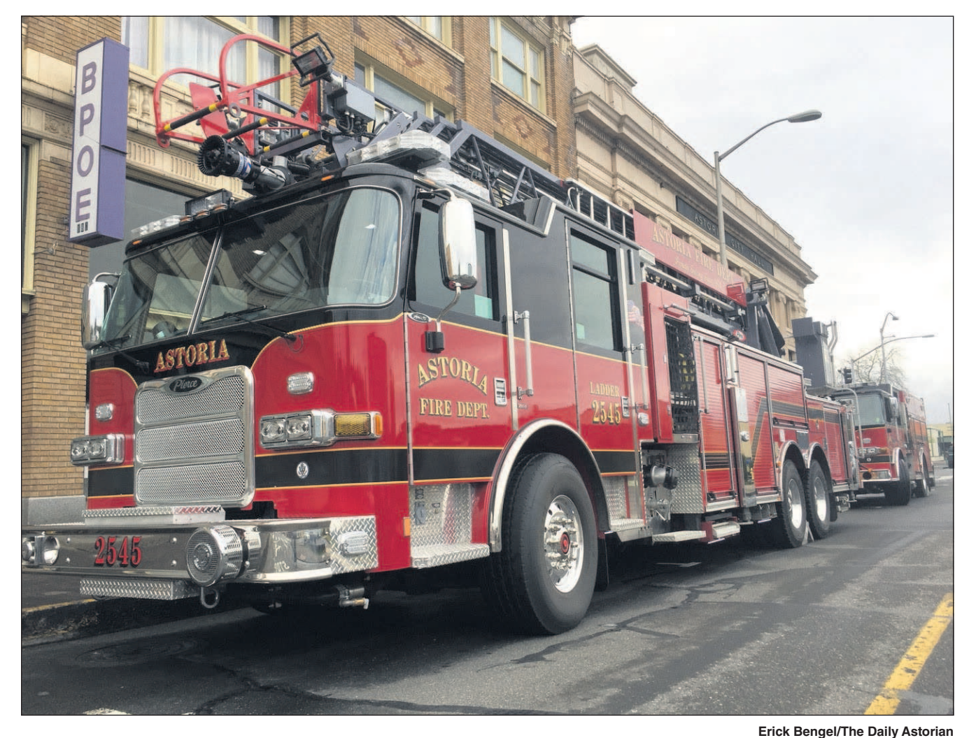
The Astoria Fire Department's new ladder truck was parked outside City Hall on Monday, with the older, smaller one behind it.