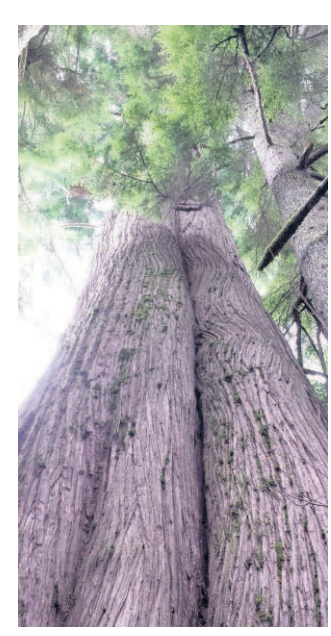
The short, 0.57-mile roundtrip trail at Teal Slough guides hikers to old-growth cedars.

Willapa National Wildlife Refuge headquarters: the quarter-mile Art Trail, consisting mostly of boardwalk; Cut-Throat Climb, a fern-laden loop three-quarters of a mile; and Teal