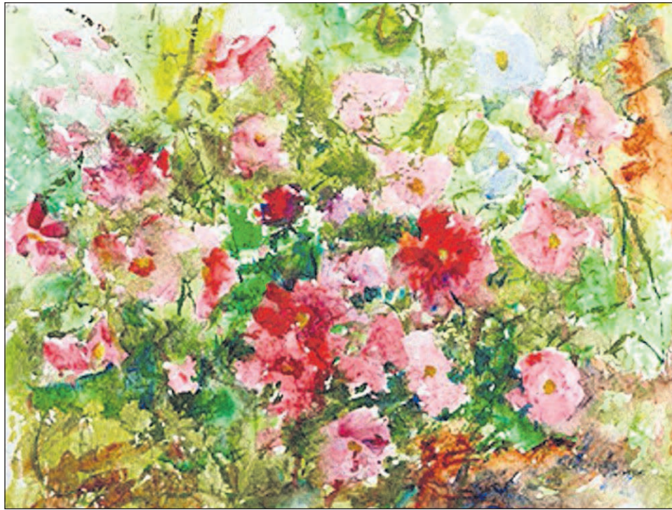
Watercolor by Eric Wiegardt

The show remains on display through the month of April. The gallery hours are 11 a.m. to 5 p.m. Saturdays. For information about this and upcoming shows, call 360-642-0522 or go to ArtPort Gallery on Facebook or www.artportgallery.wixsite.com/artportgallery