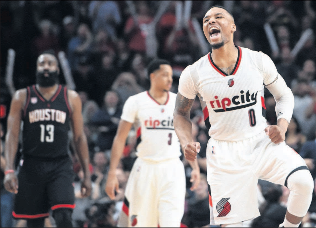
Portland Trail Blazers guard Damian Lillard celebrates as the Blazers take the lead late during the fourth quarter of an NBA basketball game against the Houston Rockets in Portland Thursday.

TODAY Baseball — Warrenton at Amity, 1 p.m. SATURDAY Baseball — Willamina at Warrenton (2), Noon; Knappa at Santiam (2), 1 p.m. Softball — Knappa at Santiam (2), 1 p.m.