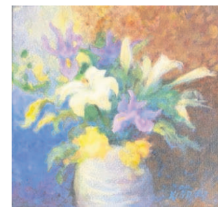
Joy of Spring