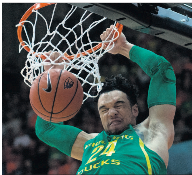
Oregon's Dillon Brooks (24) dunks during the first half of the team's against Oregon State on Saturday in Corvallis.