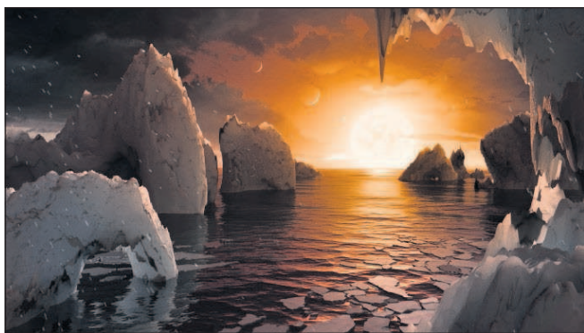
An artist's conception of what the surface of the exoplanet TRAPPIST-1f may look like, based on available data about its diameter, mass and distances from the host star.

life-bearing worlds out there just waiting to be found," she said.