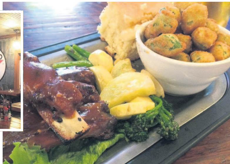
The Mouth tried the Lite Bites version of ribs, which came with three ribs, broccolini, squash, cornbread and fried okra.

shepherded me in a direction the servers didn't, as the cornbread absolutely made the meal. It was critical, buttressing the plate's comfort — like pillow top on a mattress. The fried okra were crispy, a vegetable alternative to tater tots. The broccolini and squash were sopped with butter. The ribs themselves — and there were four rather than three — were hardly falling off the bone. But the crusted edges appropriated something nearing jerky, which I found enjoyable in its own right. The Roadhouse's own barbecue sauce was easy, neither too spicy nor too sweet. Really it was the cornbread that was most irresistible, the ideal counterpart to the fatty meats and elemental veggies, a crumbly, simple, lightly sweet, spongy bread, with butter and honey on top and bottom.