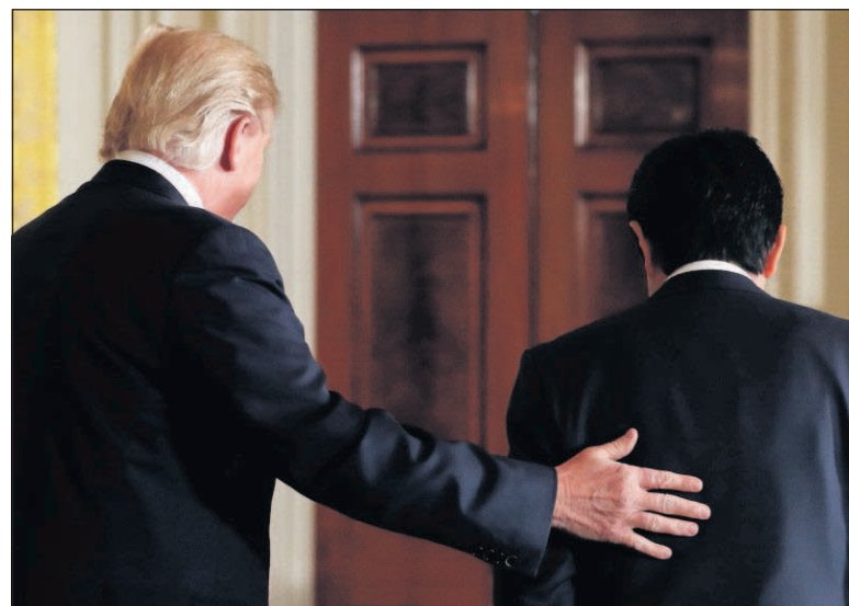
President Donald Trump and Japanese Prime Minister Shinzo Abe walk from the stage at the conclusion of a joint new conference in the East Room of the White House on Friday.

At the heart of Trumpism is the perception that the world is a dark, savage place, and therefore ruthlessness, selfishness and callousness are required to survive in it. It is the utter conviction, as Trump put it, that murder rates are at a 47-year high, even though in fact they are close to a 57-year low. It is the utter conviction that we are engaged in an apocalyptic war against radical