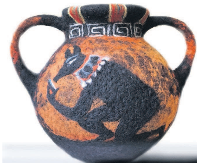
"The Way They Live Today," a needle-felting on wool over armature piece by Stacy Polson at RiverSea Gallery.