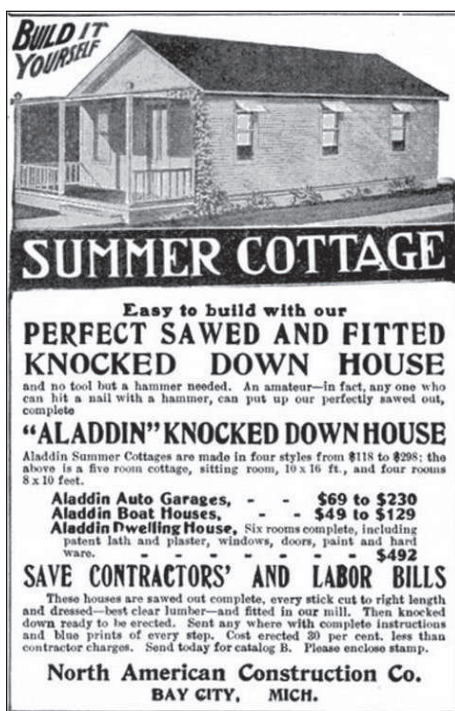
Aladdin Redi-Cut Advertisement for knocked-down kits for houses, in Popular Mechanics, May 1908.