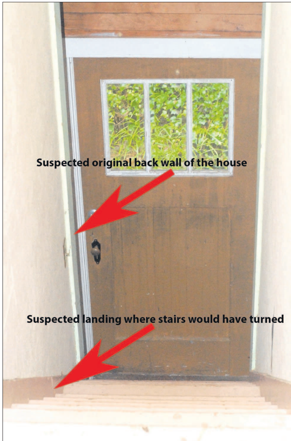
The back door and the marks where the hidden door might be.