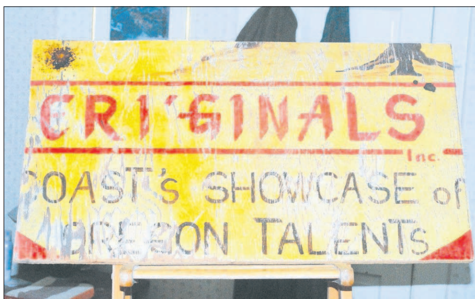
A sign found in a makeshift closet.