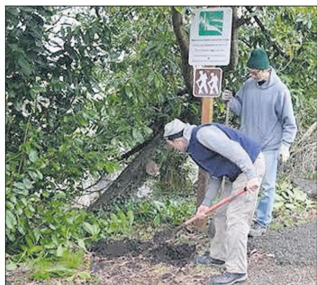
Submitted Photo Northwest Coast Trails Coalition volunteers held a work party to connect two trails at Clatsop Community College.