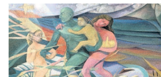
"Displacement" by Billy Lutz at T.anjuli.