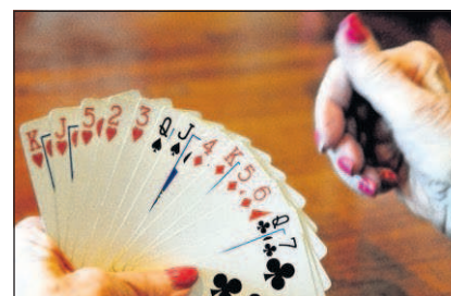
A card player studies her hand during a bridge game at a restaurant in St. Paul, Minn.