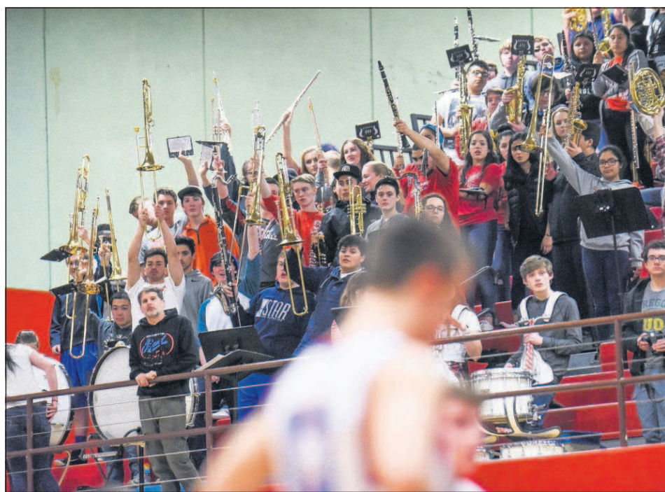
The Seaside High School band raises their instruments in the air as the Seaside basketball team shoots free throws after a foul call in the first half during a game against Valley Catholic Tuesday.