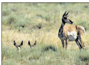
A pronghorn antelope doe keeps watch as two fawns peer out from tall grass in southeastern Oregon.

BOISE, Idaho — A change in U.S. House rules making it easier to transfer millions of acres of federal public lands to states is worrying hunters and other outdoor enthusiasts across the West who fear losing access.