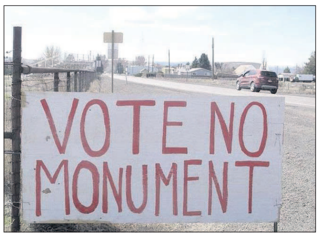
A sign posted in Jordan Valley opposes the Owyhee Canyonlands National Monument in Malheur County. Jordan Valley is nearly surrounded by the proposed monument.

The fate of the 2.5 million-acre region along the Idaho border has been the subject of heated controversy for more than a year. Several environmental groups and the Keen footwear company have campaigned for the monument designation, saying it's needed to protect the rugged landscape.