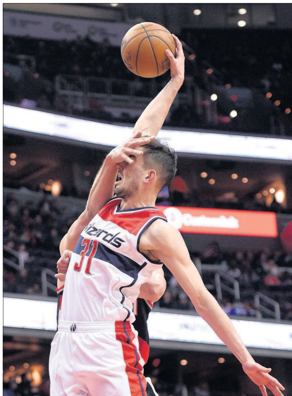
Wizards guard Tomas Satoransky gets a hand in the face by Trail Blazers forward Meyers Leonard, back, Monday in Washington. The Wizards won 120-101.

“I think early in the game when guys get good looks and they see the ball go in, they get confident, they start believing,” Lillard said. “Later in the game when we started to contest shots and have more of a presence, it didn’t