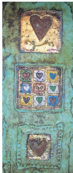
See bronze sculptures at Luminari Arts.