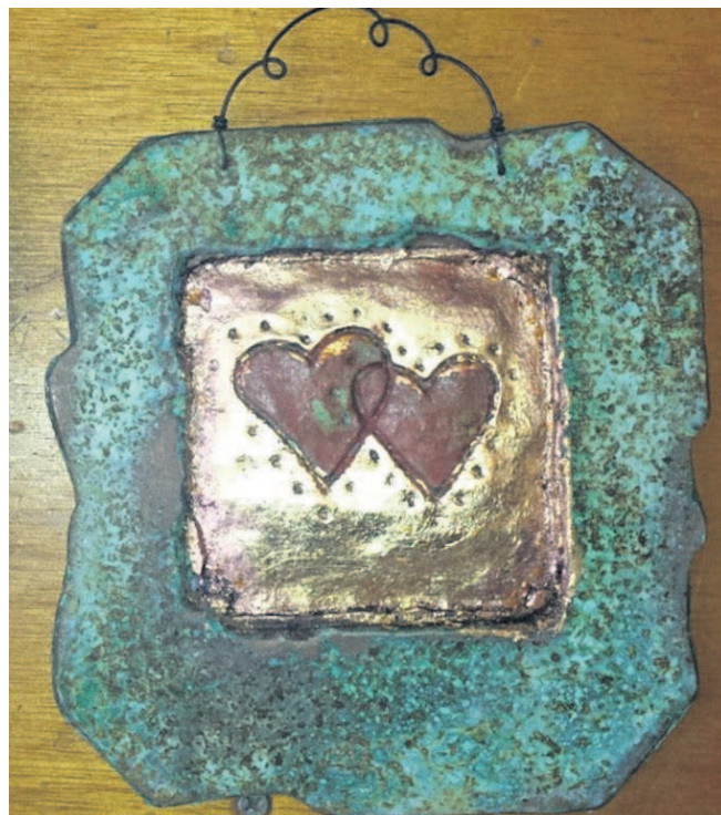
See bronze sculptures at Luminari Arts.