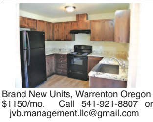
Brand New Units, Warrenton Oregon $1150/mo. Call 541-921-8807 or jvb.management.llc@gmail.com