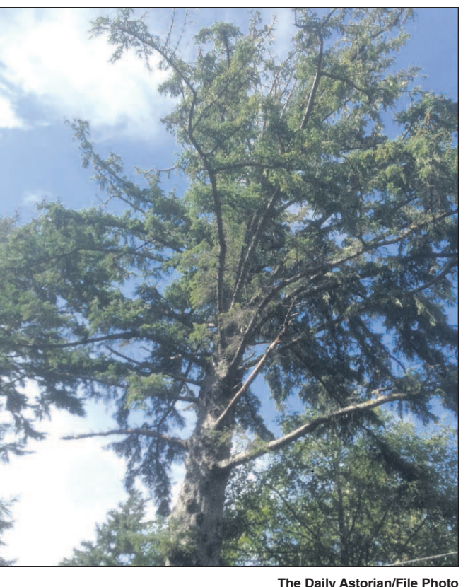
Trees fill the city, like this reaching to the sky at Spruce and Harrison streets.

"Thinning will allow the healthy tree specimens that