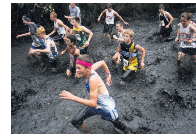
High school competitors sprint through a mud pit at the 3-Course-Challenge on Sept. 17 at Camp Rilea.