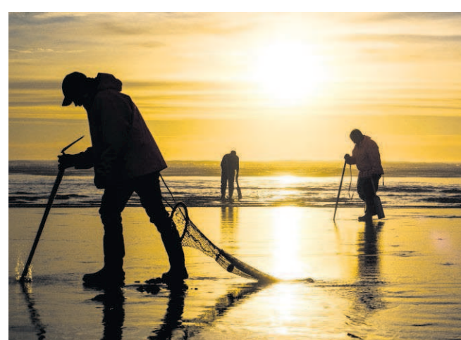
Visitors search for clams along the beach at Fort Stevens State Park on Feb. 9. Starting in the spring, local doctors were able to begin writing prescriptions that are good for free entrance into state and national parks and community recreation centers.