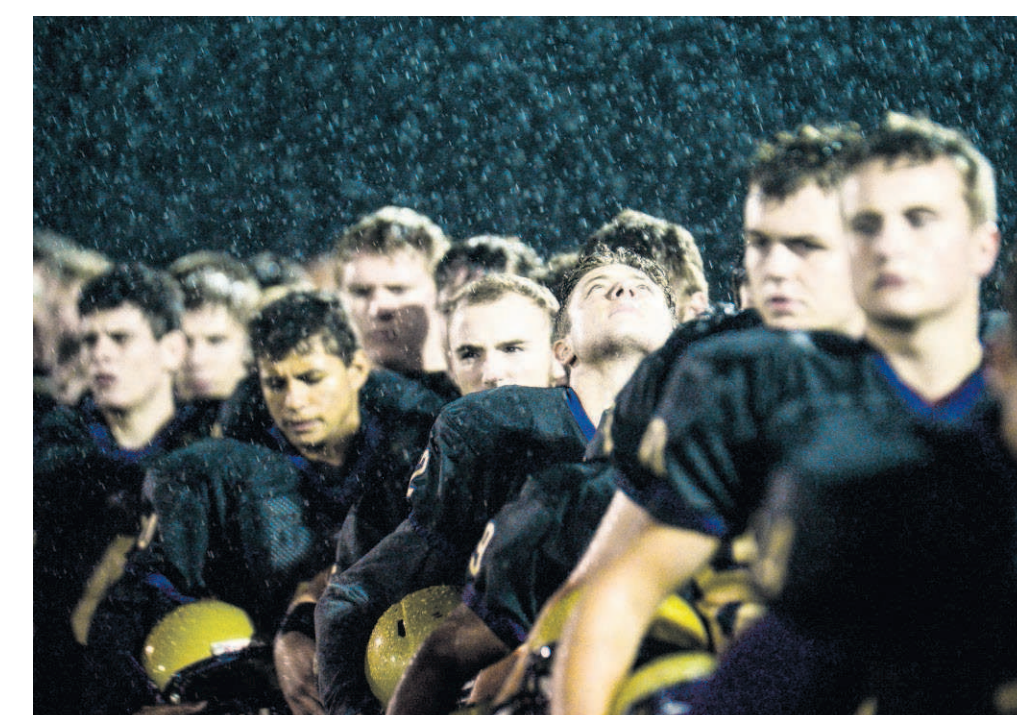
Rain falls as Astoria football players stand at attention for the national anthem before facing off against Banks on Oct. 13 at CMH Field in Astoria.