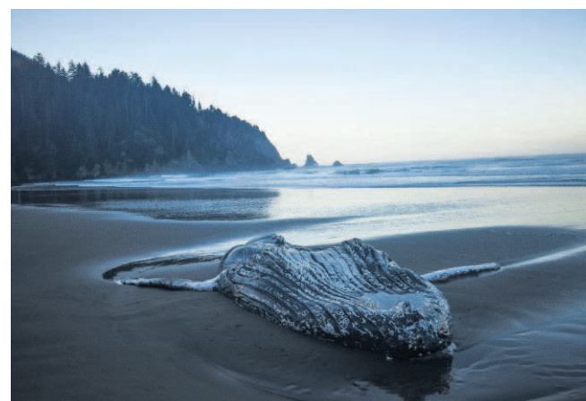
The remains from a dead humpback whale washed up on Short Sand Beach on Sept. 20 at Oswald West State Park.