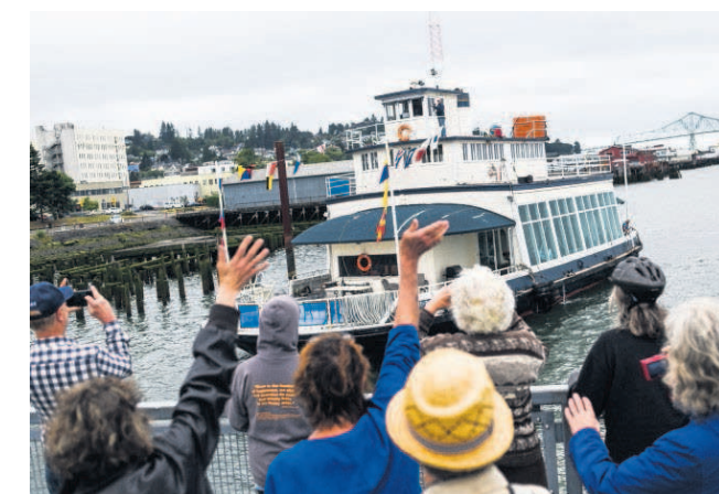
Community members cheer and wave as the historic Tourist No. 2 ferry arrives Aug. 1 in Astoria.