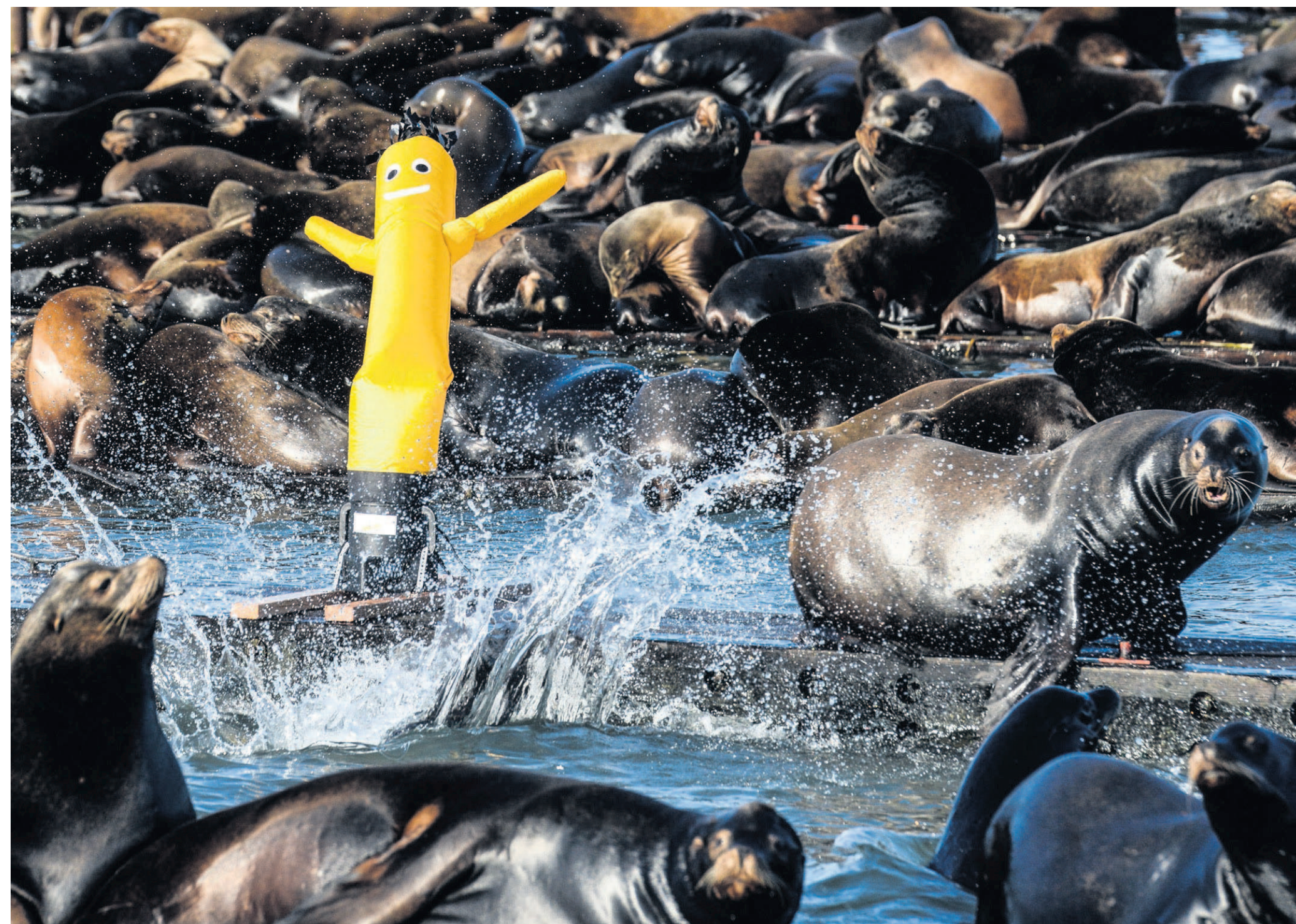
Sea lions and harbor seals dive off the docks of the East End Mooring Basin after crews from the Port of Astoria inflated air dancers in an attempt to scare the pinnipeds on March 17.