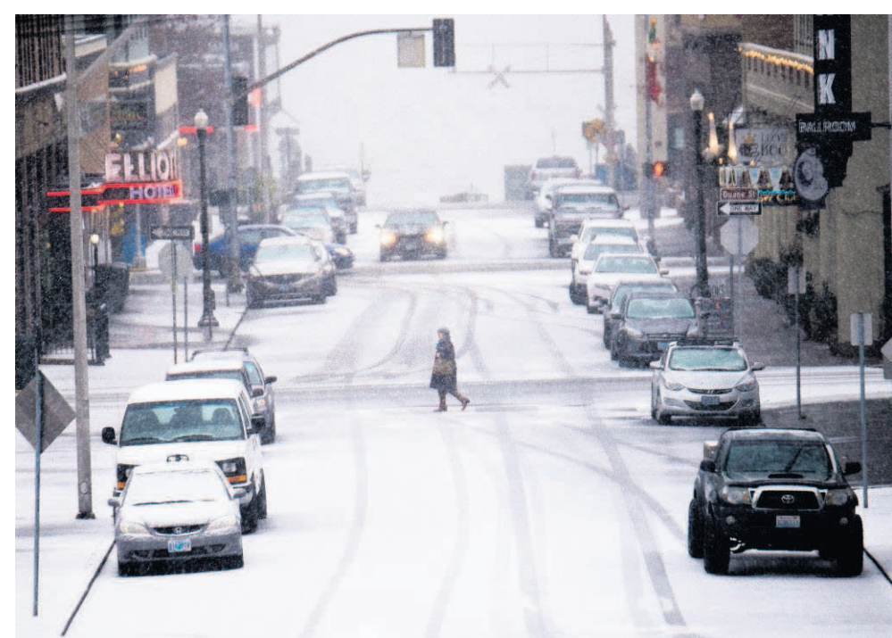
A woman crosses 14th Street as snow falls in downtown Astoria on Dec. 8. The last few weeks of 2016 saw some freezing temperatures and icy roads in Clatsop County.