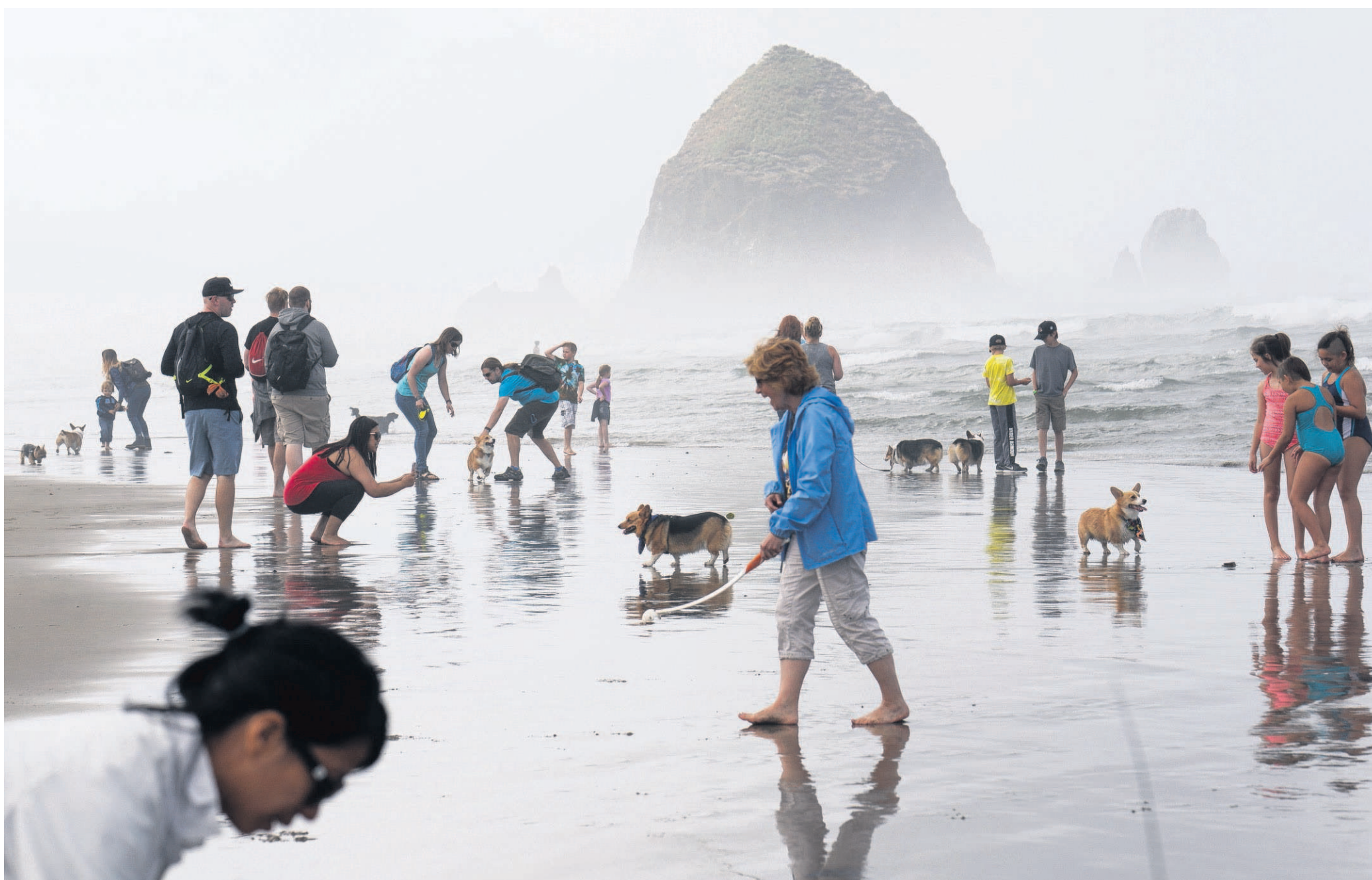
Hundreds of corgis, their owners and admirers walk up and down the beach during the fourth annual Oregon Corgi Beach Day benefiting the Oregon Humane Society on June 30 in Cannon Beach. The event included a beach-themed costume competition, a raffle, beanbag toss and other activities.