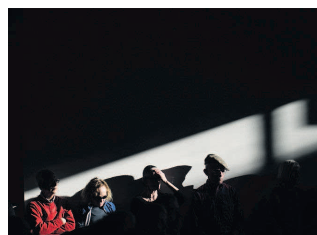
Audience members shield their eyes from sunshine as Pulitzer Prize-winning journalist Isabel Wilkerson speaks during a Think and Drink event organized by Oregon Humanities on July 21 at the Fort George Lovell Showroom in Astoria.