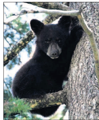
A black bear cub rests on a tree limb at the Sanctuary in Idaho.

Perhaps Snowdon's best-known visitor was Boo Boo, a black bear cub burned in a fire near Salmon in summer 2012 and released into the wild in May 2013.