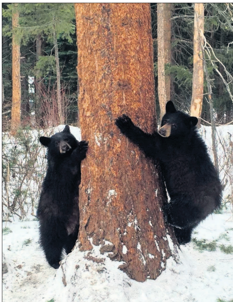
Snowdon Wildlife Sanctuary Photos

Snowdon rehabbed a facility-record 15 bears last winter, including Mr. Cinnamon, who turned out to be more than a year old but underweight when he was rolling through that Cascade neighborhood. The facility doesn't have any bears so far this winter.