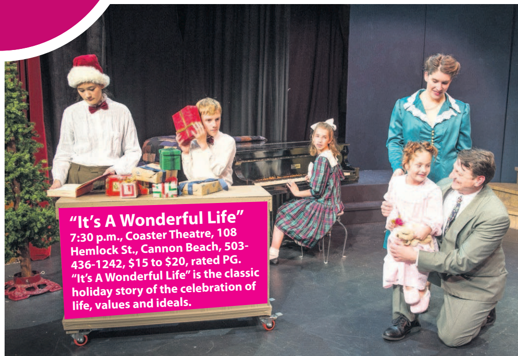
"It's A Wonderful Life" 7:30 p.m., Coaster Theatre, 108 Hemlock St., Cannon Beach, 503-436-1242, $15 to $20, rated PG. "It's A Wonderful Life" is the classic holiday story of the celebration of life, values and ideals.