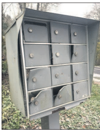
Damaged cluster mailbox near Irving and 22nd Street.

• The U.S. Postal Service , which hasn't been able to install a new cluster mailbox near Irving Avenue and 22nd Street in Astoria after the one there was vandalized and severely damaged in September. The vandalism has forced 12 postal customers to travel to the Astoria Post Office to pick up their daily mail. Sarah Green, the post office supervisor, said a new replacement collections box has arrived at the post office, but the post office is still waiting to receive the hardware to assemble the box so it can be installed.