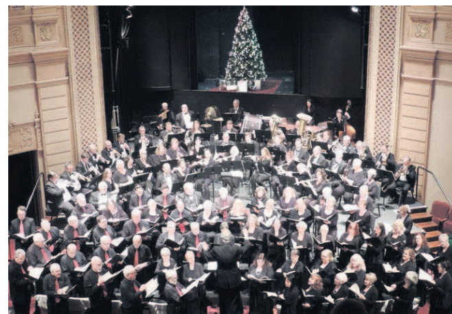
The North Coast Symphonic Band will perform with the North Coast Chorale at the Liberty Theatre on Saturday, Dec. 17.