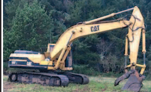
Cat 322 L Excavator Comes with 3 Buckets, Low Hours, Asking $44,900. 503-338-0485