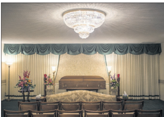
This Monday, Jan. 25, 2016 photo shows a room inside a funeral home in Saginaw, Mich. According to a study by the government released today, life expectancy in the United States has fallen for the first time in more than 20 years.

The CDC report is based mainly on 2015 death certificates. There were more than 2.7 million deaths, or about 86,000 more than the previous year. The increase in raw numbers partly reflects the nation’s