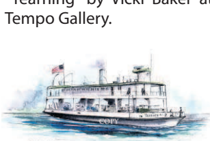
Learn about the Astoria Ferry at Old Town Framing during art walk.