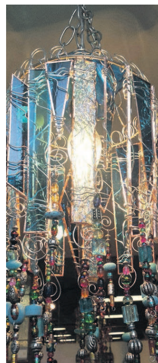
Find upcycled windchimes and lamps at Luminari Arts.