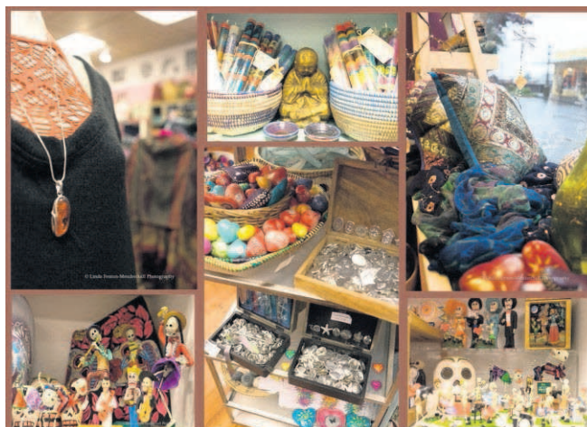
Moxie features fair trade items and art.