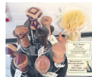
Wine stoppers by Jim Schoeffel.