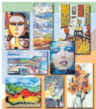
Paintings by the Green Cab Collective at Beach Books.

30 years of mature thematic painting. His artwork focuses on what lies beneath appearances.