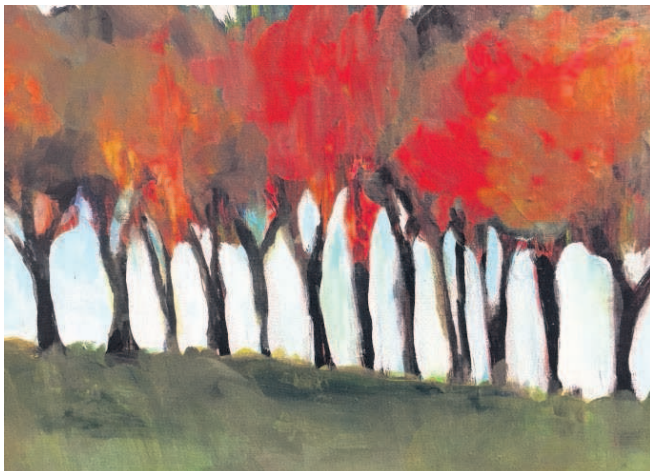
"Trees" by Gheri Fouts.

The show will continue on view throughout the month.