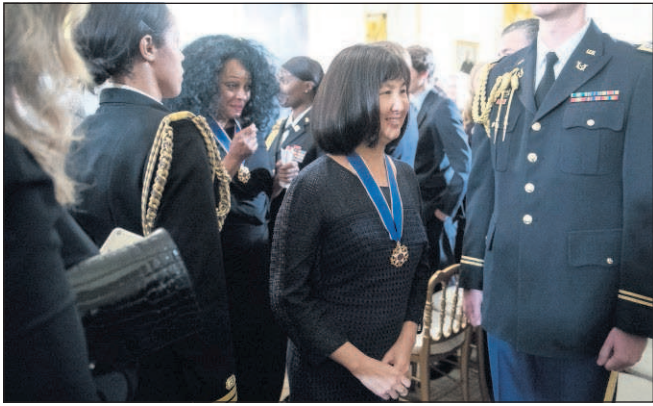
LEFT: Artist and designer Maya Lin departs after receiving the Presidential Medal of Freedom at a ceremony in the East Room of the White House on Tuesday in Washington. RIGHT: President Barack Obama presents the Presidential Medal of Freedom to former NBA basketball player Michael Jordan. Obama is recognizing 21 Americans with the nation's highest civilian award, including giants of the entertainment industry, sports legends, activists and innovators.

Michael Jordan and Kareem Abdul-Jabbar, two of the greatest basketball players ever, were also among the honorees. Obama noted how Jordan's name is synonymous