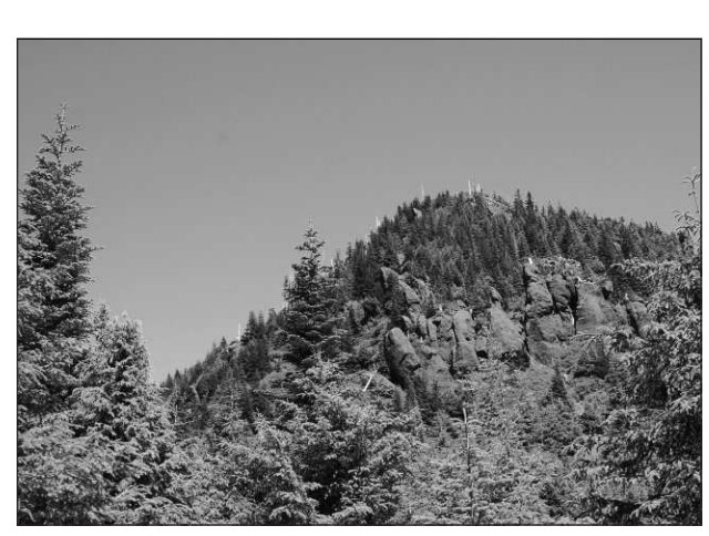
North Coast Land Conservancy Onion Peak may become part of North Coast Land Conservancy's "Coastal Edge" vision of the coast.