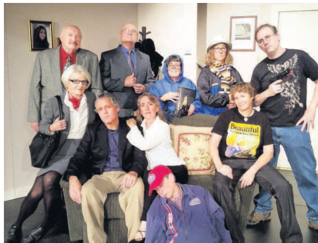
The Riverbend Players will present the play “Dead Giveaway” this November at the NCRD in Nehalem.

On Saturday, activities include a mystery version of story time for children featuring the book “Where’s My Teddy” by