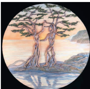
SUBMITTED PHOTO “Sunset Tango” by Terrie Remington.

Paino works with multi-media on canvas and paper using acrylics, watercolor and incorporating paper she’s enhanced using techniques including