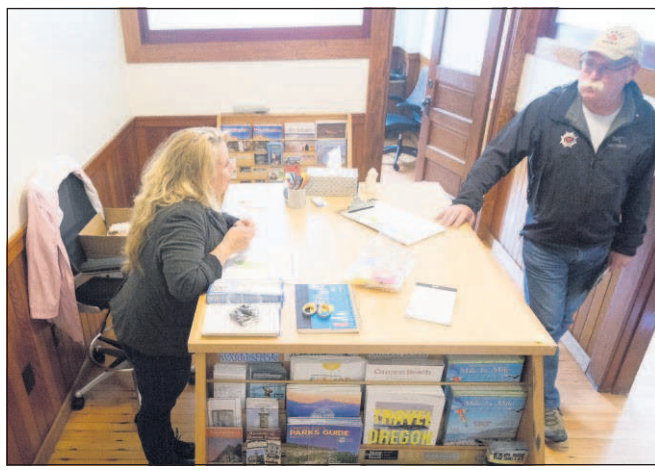
Within minutes of opening the new visitor center, the first curious customers, visitors from Canada, stopped in to inquire about the area.