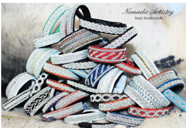
An artist at Finn Ware will demonstrate the art of Sami jewelry making during art walk.