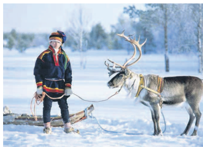
Learn about the jewelry of the Sami people, who live in northern Scandinavia, at Finn Ware during art walk.